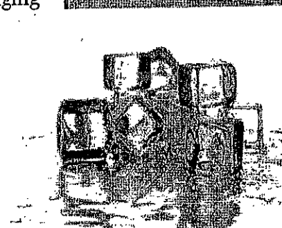
The temperature at which ice turns to liquid is its melting point.