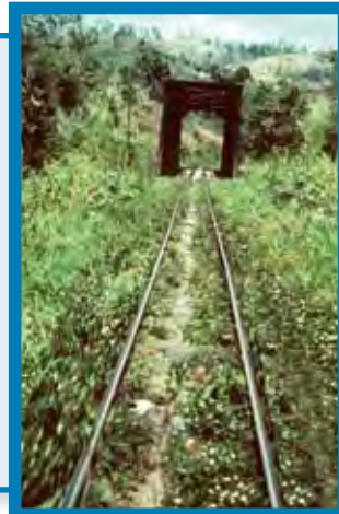
Before the earthquake.

The main railroad line between Puerto Barrios and Guatemala City in the Central American country of Guatemala was moved and twisted after a massive earthquake occurred on February 4, 1976. The earthquake killed 23,000 people and injured 76,000 people.