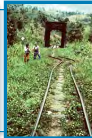
After the earthquake.