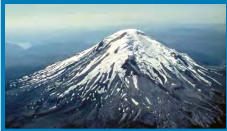
Before the eruption.

Mount St. Helens, a volcanic mountain located in southwestern Washington State, had not erupted since 1850. On May 18, 1980, a huge eruption caused widespread devastation and the loss of 57 lives. Within a zone of eight miles around Mount St. Helens, everything natural and human-made was destroyed or carried away. This eruption was the most destructive in the history of the United States.