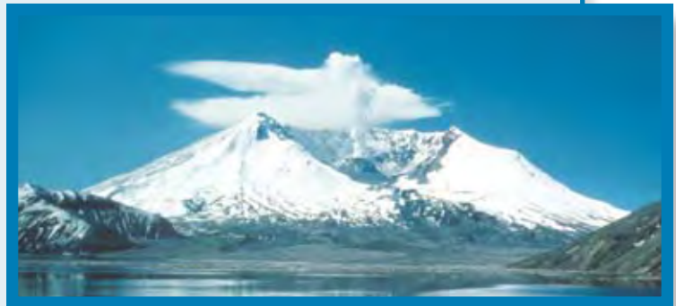
After the eruption.